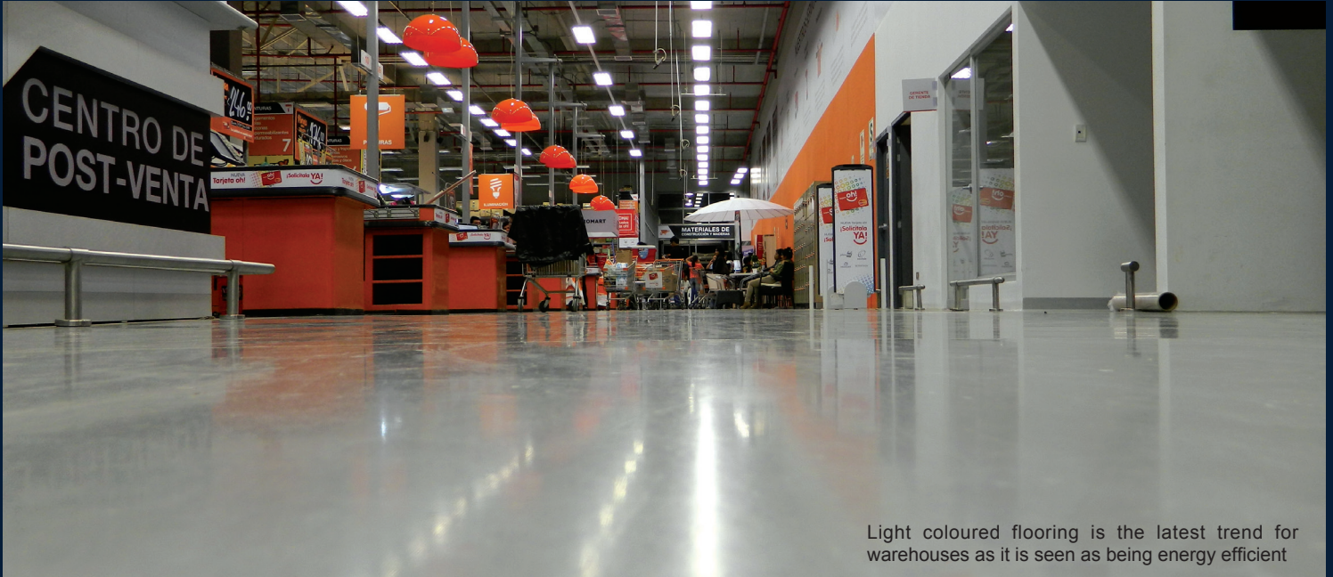
Light coloured flooring is the latest trend for warehouses as it is seen as being energy efficient

The reality is that a cheap installation has long term affects that could be far more expensive than a properly designed and installed floor